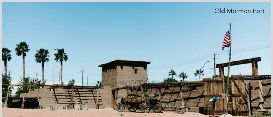
Old Mormon Fort